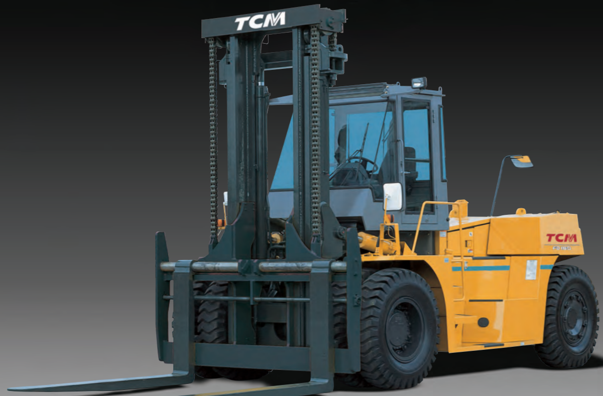
TCM yellow color available as an option.

125kW(170PS) / 2200r.p.m (SAE GROSS 170HP/2200r.p.m)